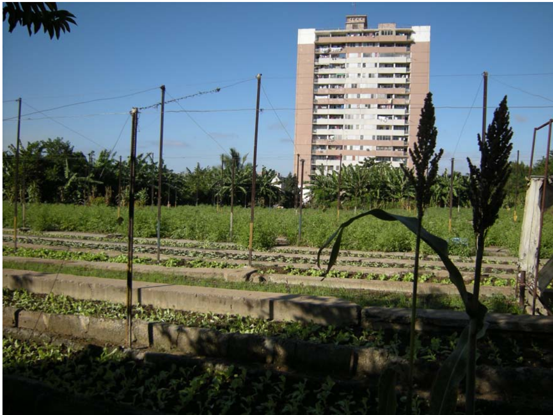
Organopónico Pastorita – at the heart of its community

Due to its location this site was perfectly situated to sell food to the local community. During my visit the Punta de Venta had a constant stream of visitors buying the day's harvest, which included huge fresh heads of lettuce and beautiful juicy tomatoes. The rest of their produce for the day had already been delivered to the nursery and school next door for lunch. The morning is the busiest time on most UA sites, before the weather gets too hot. The producer explained that they typically worked a 35 to 40 hour week but that they tended to start early in the day and finish by lunch time when all the work was done and the day's crops had been sold.