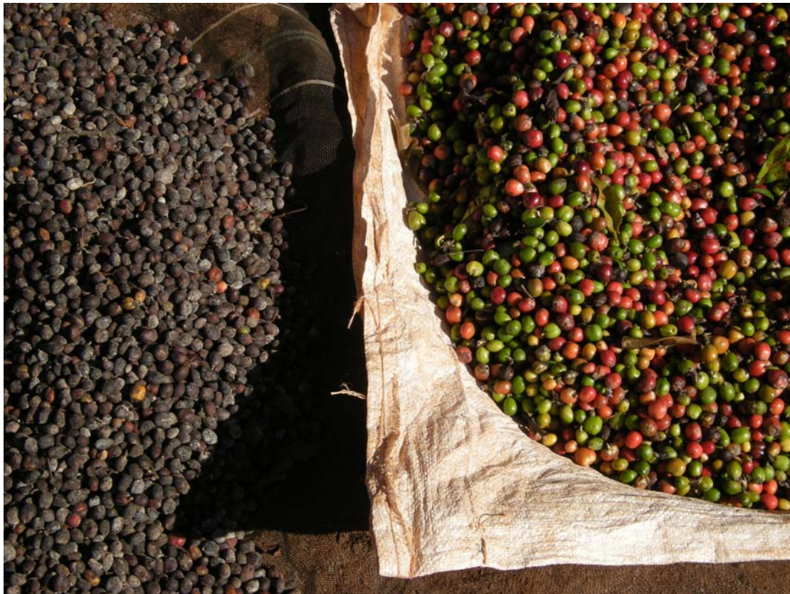
Harvesting Cuban coffee

I don't think I can say that anything about my visit was particularly unexpected or surprising. I had high expectations prior to my trip but trying to secure my visa involved a long and engage planning process which put me in touch which lots of local people so I feel that my expectations were fairly realistic. Maybe I could say that the biggest surprise was the fact that all of these expectations were far exceeded when I was in Cuba.