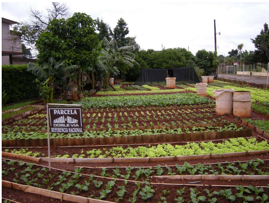
Parcela in Santiago de las Vegas