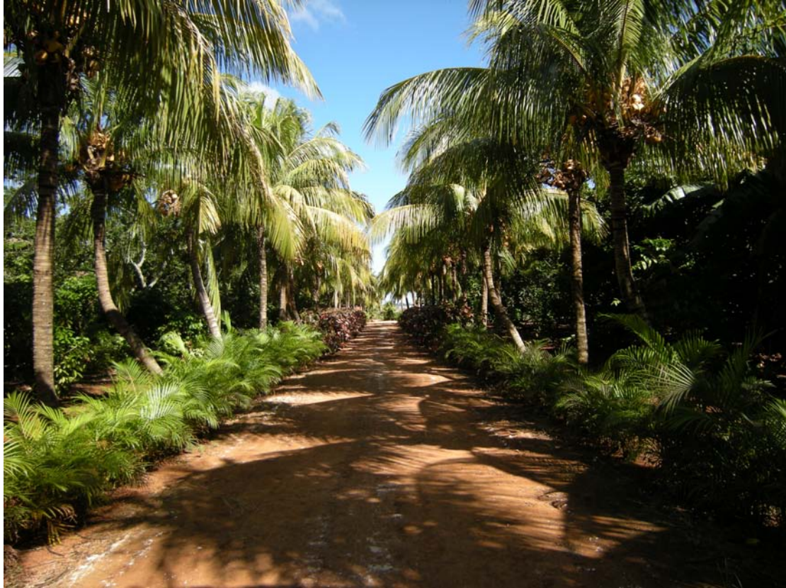
The beautiful, productive forest garden at Bejuca

way that the land has been cultivated. The finca started around 15 years ago on a site that had previously been used for industrial cultivation. During the special period it was taken over by a co-operative who now cultivate it organically and who have brought the land to cultivation entirely by hand using no machinery apart from cattle drawn ploughs.