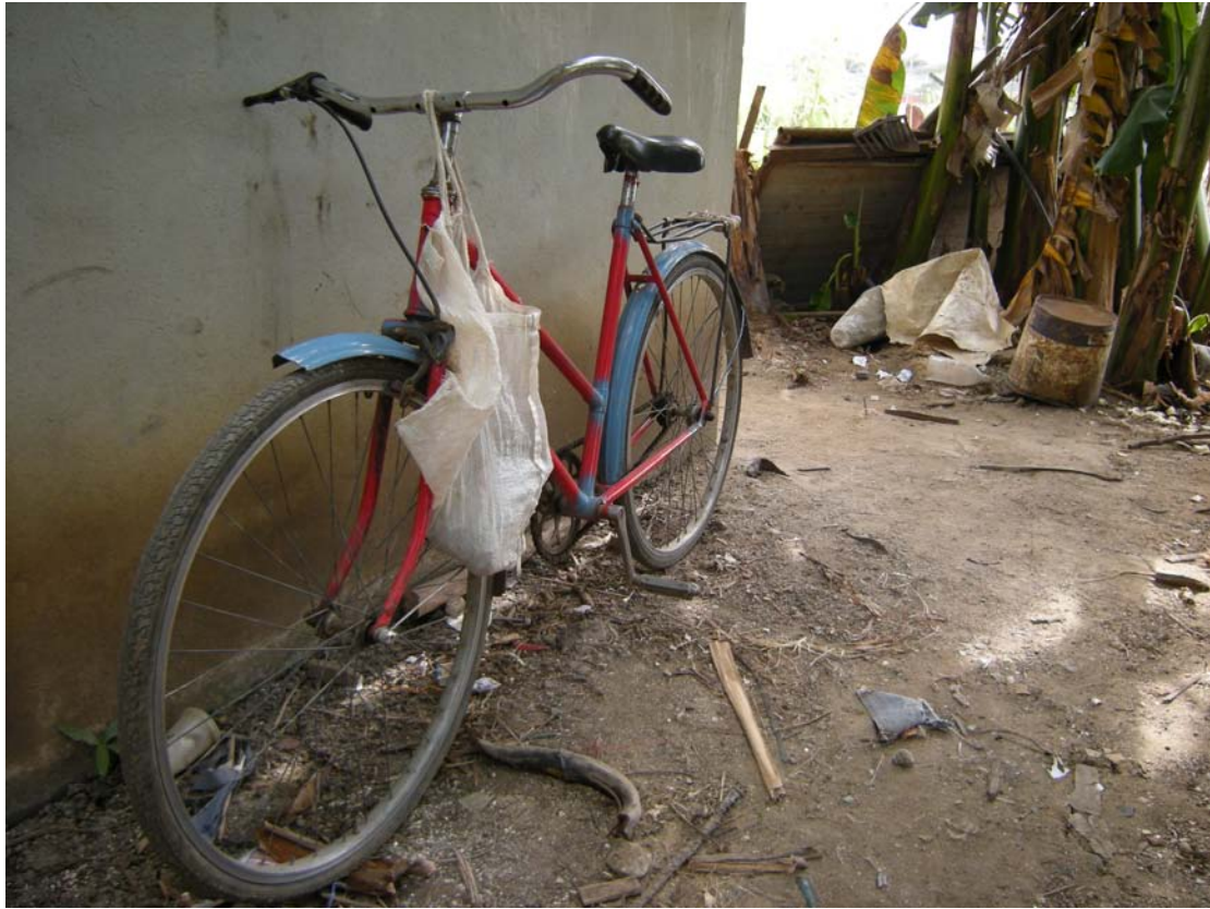
Typical transport at Organopónico Caminos