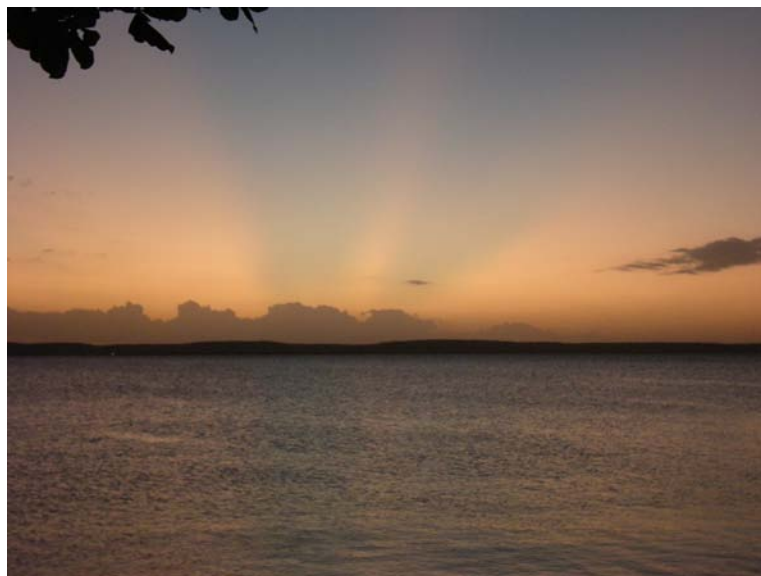
Cienfuegos beautiful bay at sunset

Physically Cienfuegos is a coastal town that is vulnerable to flooding in many parts. It's bay is one of the main attractions for image based tourism as part of its economic base. It has a highly populated in the historical areas in the centre of town. It has strong physical boundaries for growth determined by the bay itself, the airport and industrial areas so there is a need to maximize the potential for UA within these boundaries. It is surrounded by agricultural land, where a lot of livestock is kept offering other potential food sources to the town.