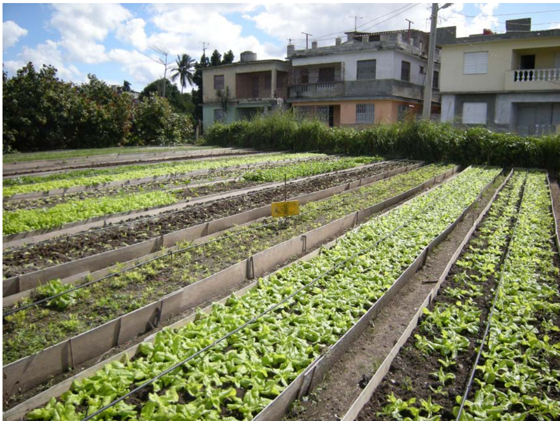
The immaculate Organopónico Patria

The producer who showed me around explained that the site was cultivated by six people – five of who had been retired, but who had been able to come back into work thanks to the creation of this organopónico. He was also very proud to talk about the awards for excellence that their beautiful productive site had won, expressing clearly how important it was to ensure that food producers were valued for what they did and that they had the opportunity to continue and developing throughout their careers. This was a perfect example of the way that a support infrastructure is essential so that producers are able to learn how to get the best out of their land and so that they are able to keep up to date with the latest developments in agro-ecology and UA as they arise.