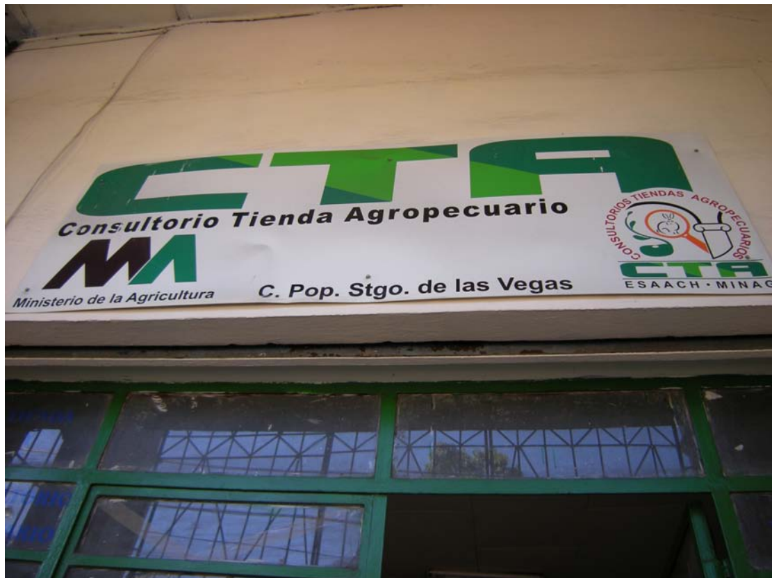
Tienda Agropecuario in Santiago de las Vegas

“It is the perception of a person of their position in life in the context of their cultural system and the value system of their life.”