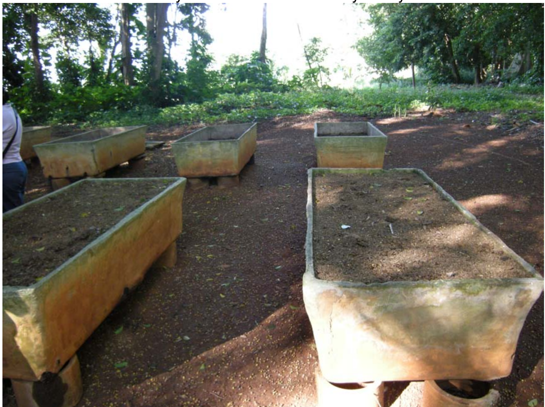
Making Worm Compost at INIFAT