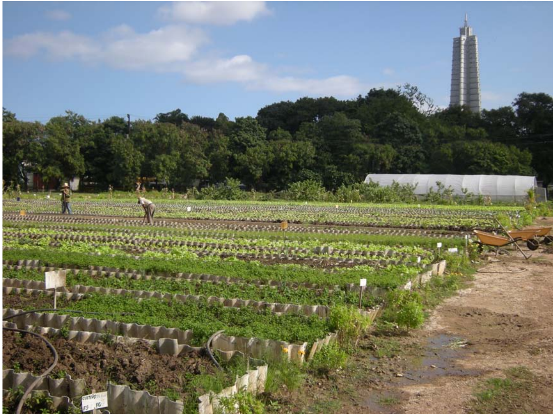
Organopónico Plaza in Havana

A couple of years before the site was founded Raul Castro had visited an early UA site and made the following speech inspired by what he saw which is an excellent way of encapsulating the Cuban approach to urban food production: