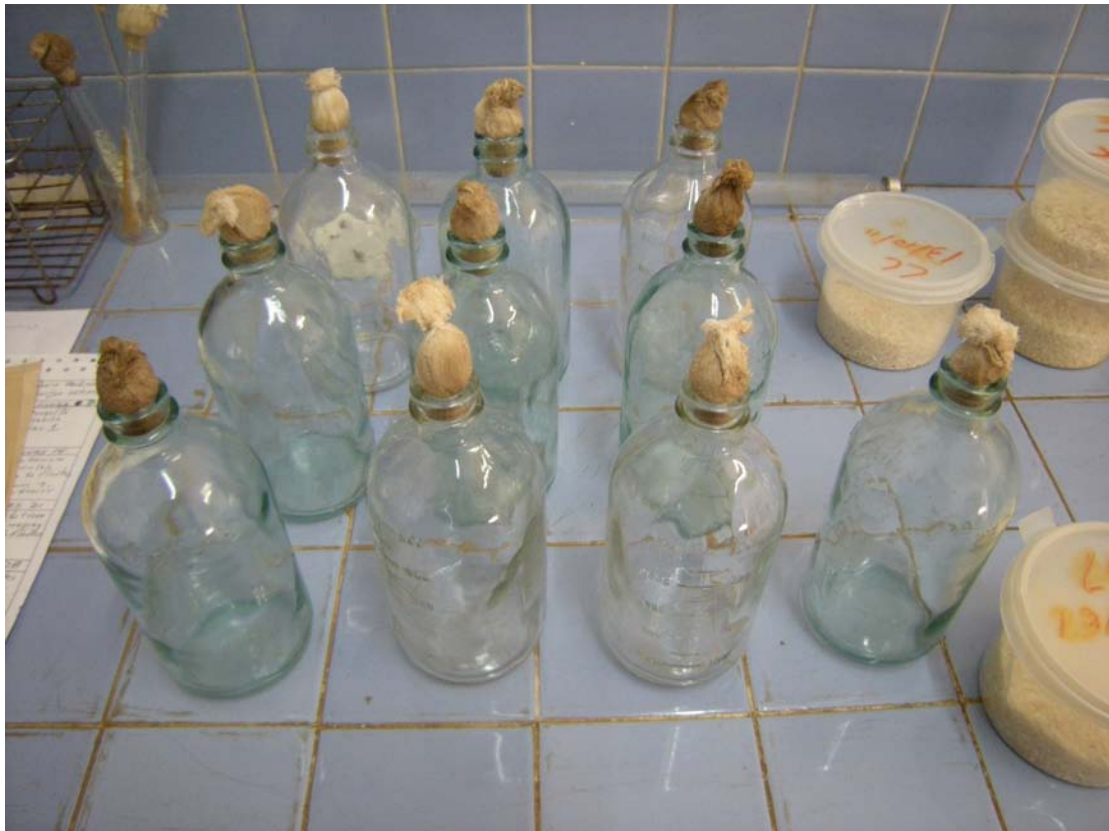
Work in Maria's lab at INIFAT

Organisms that develop within the body of another insect with the capacity to cause sickness or death. They are generally micro-organisms and may include bacteria, fungi, viruses and nematodes.