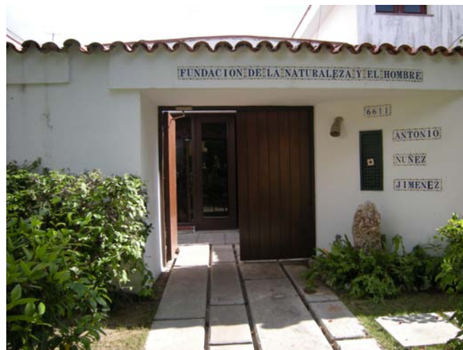
Visit to FANJ in Miramar

FANJ is a civil organisation based in Havana and one of the few NGOs in Cuba. It was founded to continue the legacy of the work of Dr. Antonio Núñez Jiménez through research and development of programmes that promote values towards a culture with a focus upon nature in the local, national and international. They aim to develop a social conscience that reconnects nature with the national cultural identity. They are now an organisation that is known, through the experience and capacity of their work, committed to the Cuban society and the world in solving environmental problems, with a perspective that integrates a socio-cultural dimension.