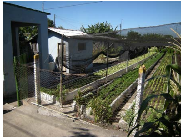
A central location for Organopónico Calzada

This was a beautiful little organopónico close to the centre of Cienfuegos. As Cienfuegos is a historical centre there is no UA right at its heart. However, this small site was a couple of minutes walk from the centre in the middle of a residential district. The site stood on the corner of the road at a busy intersection for people and traffic – traffic being mainly buses, bikes and horse drawn vehicles. Unfortunately it was closed when I visited so I couldn't go onto the site to look around in more detail but it was possible to have a pretty good look through the low wire fencing. There was a small stall to sell produce directly to people in the local community and the beds were brimming with produce ready to be picked and eaten.