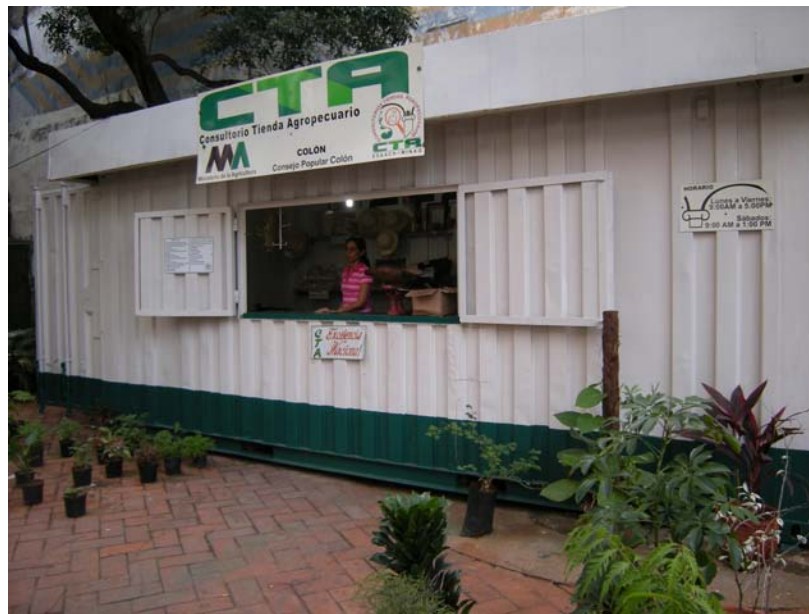
CTA at the heart of busy Havana Centro

Towards the end of my trip I came across this CTA on the corner of one of the busiest streets in central Havana. This is a neighbourhood where there is very little free space so you would not expect people to be growing their own food, but the presence of the CTA suggested otherwise. Although there were not many formal growing sites in this part of the city the stall served to support people who were growing food on balconies and roofs or in patios and gardens. Although these kinds of growing sites are not so prevalent, they are seen as being crucial to food security in urban areas and support is offered to people producing food in this was at every possible opportunity.