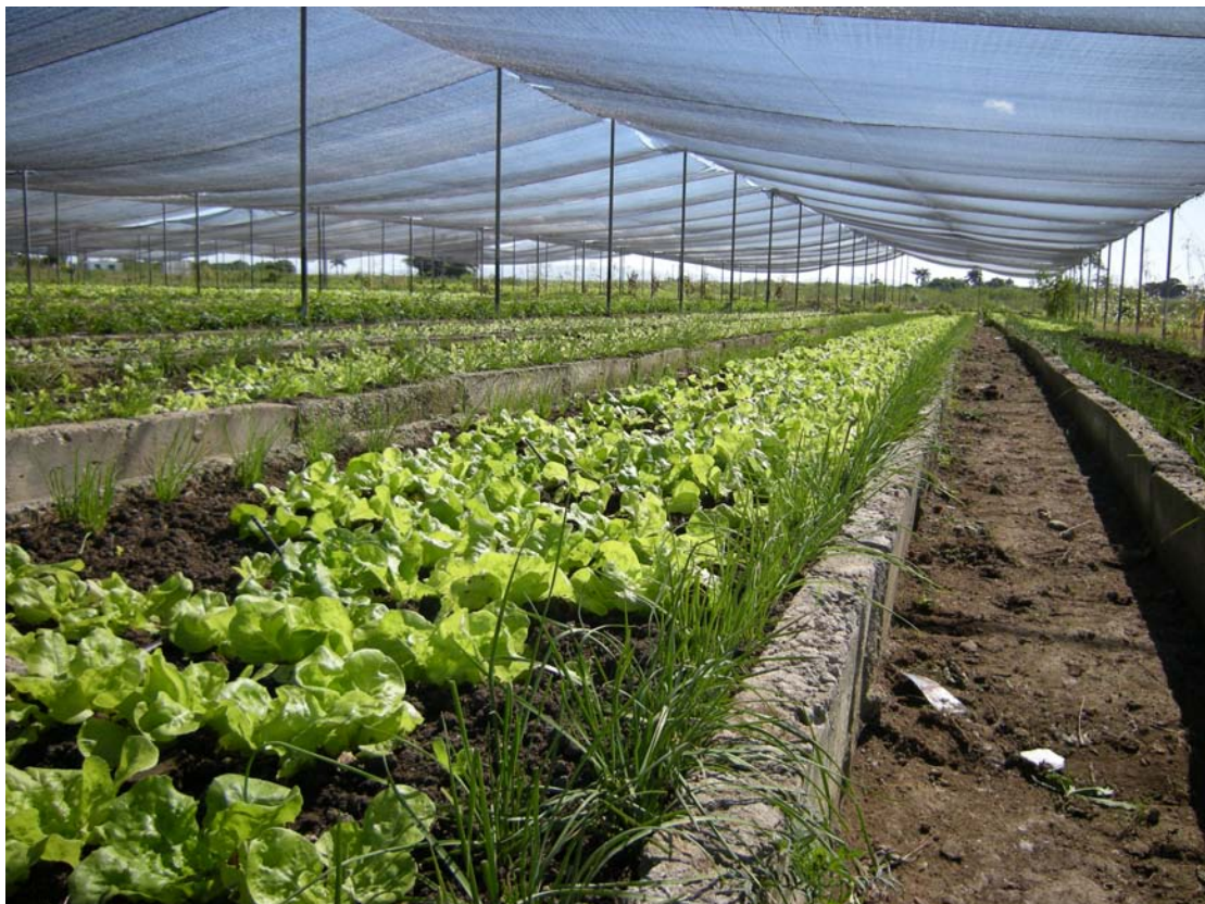
Semi-protected cultivation at Organopónico Aeropuerto