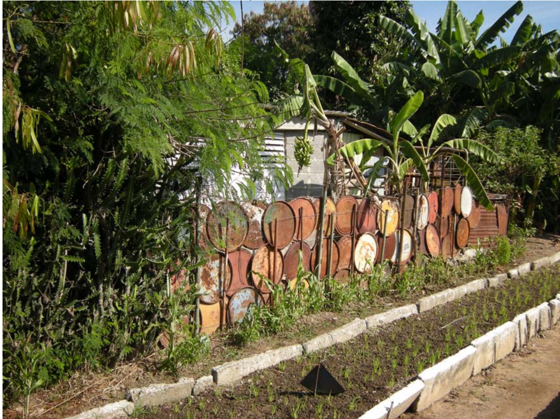
Beautiful use of recycled materials at Organopónico Universidad

stall. As with all the food producers I met it was clear that he gained great pleasure from his work and from the part that he played in his local community as a result of his job. Another perfect example of the positive contribution that UA can make to community development and community cohesion.