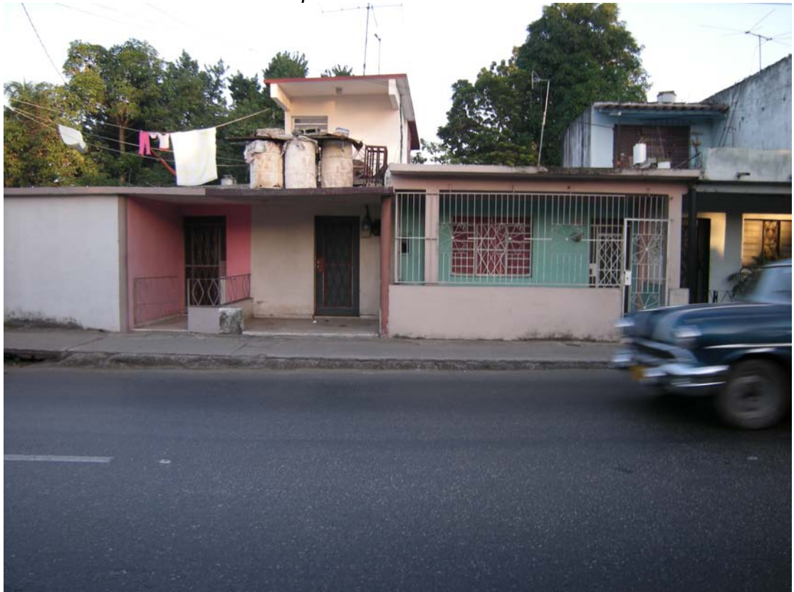
Typical Street in Santiago de las Vegas